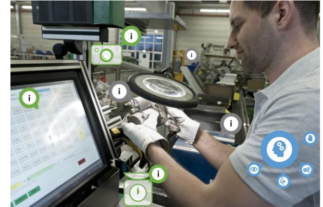
Humans and artificial intelligence complement each other in the project "EIBA".

learning as well as deep learning - the system should be able to identify products and compare them with other available information. By continuously expanding the data, it should also be able to adapt to new products and requirements.