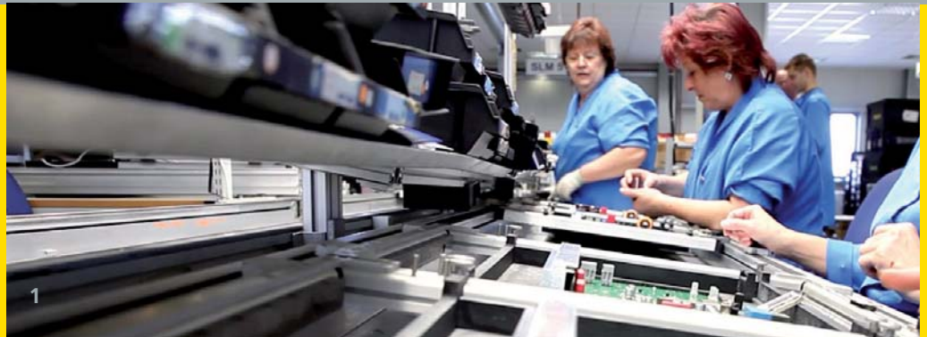
1 Typical manufacturing operation.