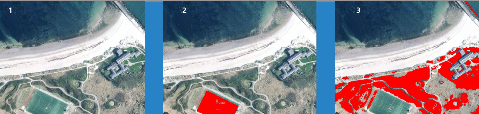
1 Orthophoto of Heligoland.