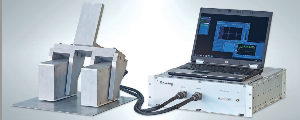
MAGNUS with holder