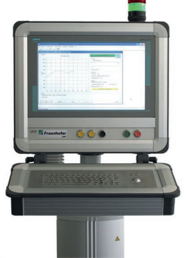
UER with pedestal base