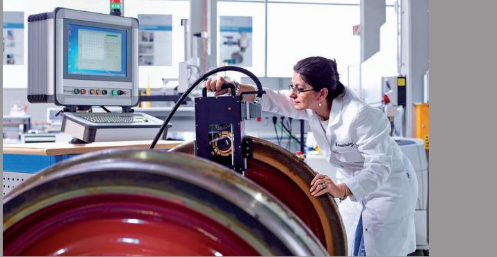
UER system in operation