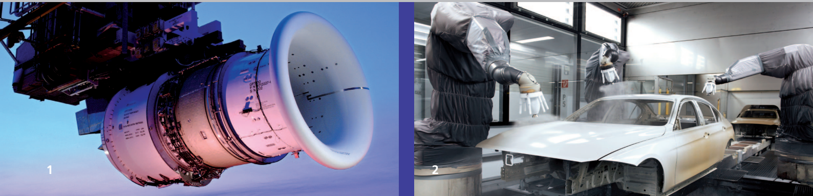
1 Inspection of coated parts for aircraft engines.